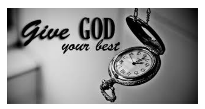
The Practice of Holiness